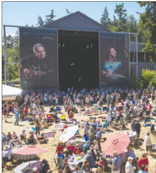
Summer Concerts at Centrum in the McCurdy Pavilion